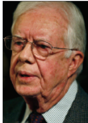
JIMMY CARTER spoke at Elon in 1989.