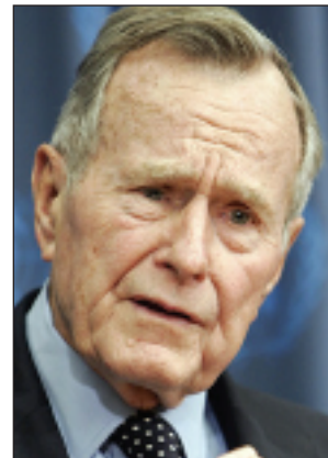
GEORGE H.W. BUSH campaigned in 1992, spoke at Elon in 2001.