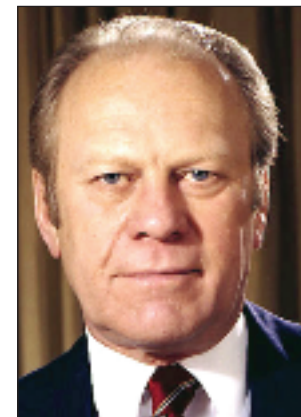
GERALD FORD spoke at Elon in 1986.