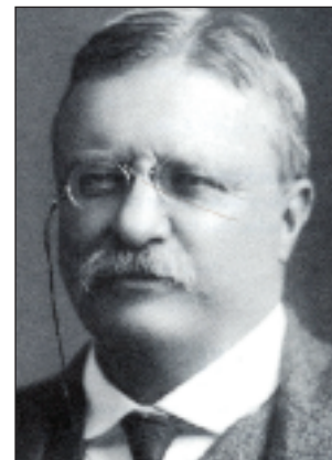
THEODORE ROOSEVELT visited area in 1904.